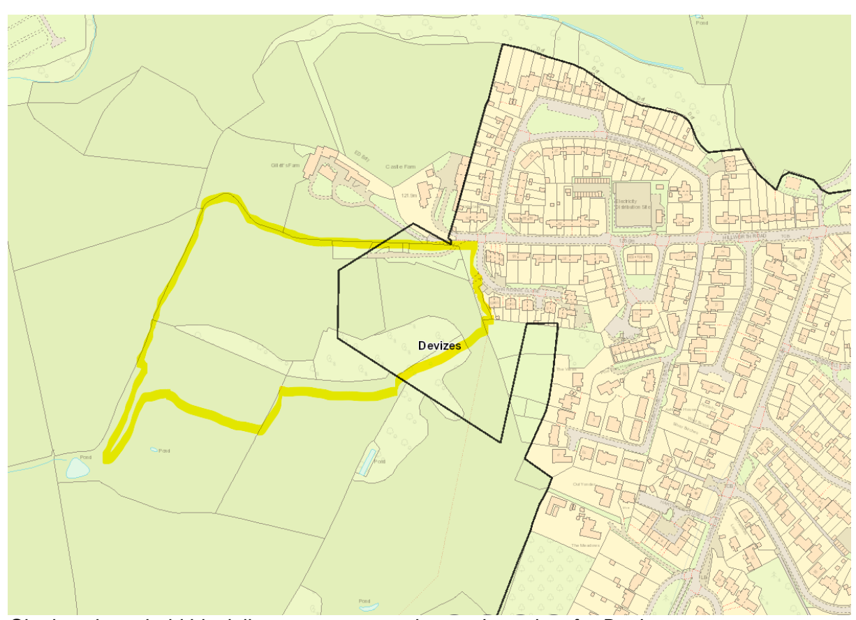
Site location – bold black line equates to settlement boundary for Devizes.

The site is approximately 4.3ha in area and is located on the south-western edge of Devizes, with the north-eastern part of the site within the settlement boundary and this edge adjoining the Devizes Air Quality Assessment Zone.