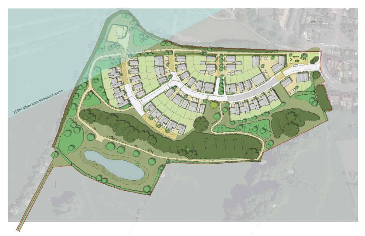
Illustrative Master Plan – for indicative purposes only

The layout of the proposed development (as shown in the 'illustrative master plan' above) has been the subject of public consultation and forms the basis for the determination of this application. This plan is for indicative purposes only and should not be construed as the final layout for the proposed scheme.